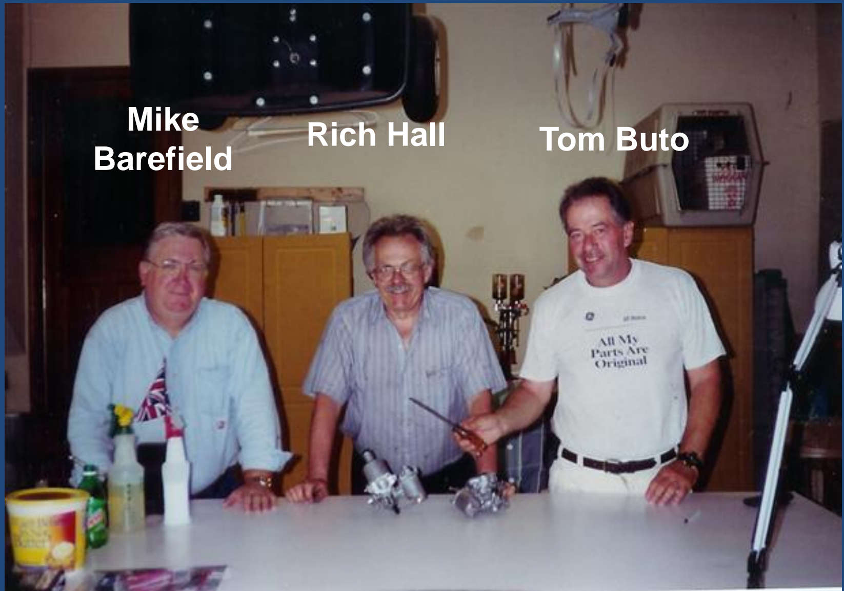
Rebuilding SU Carburetors