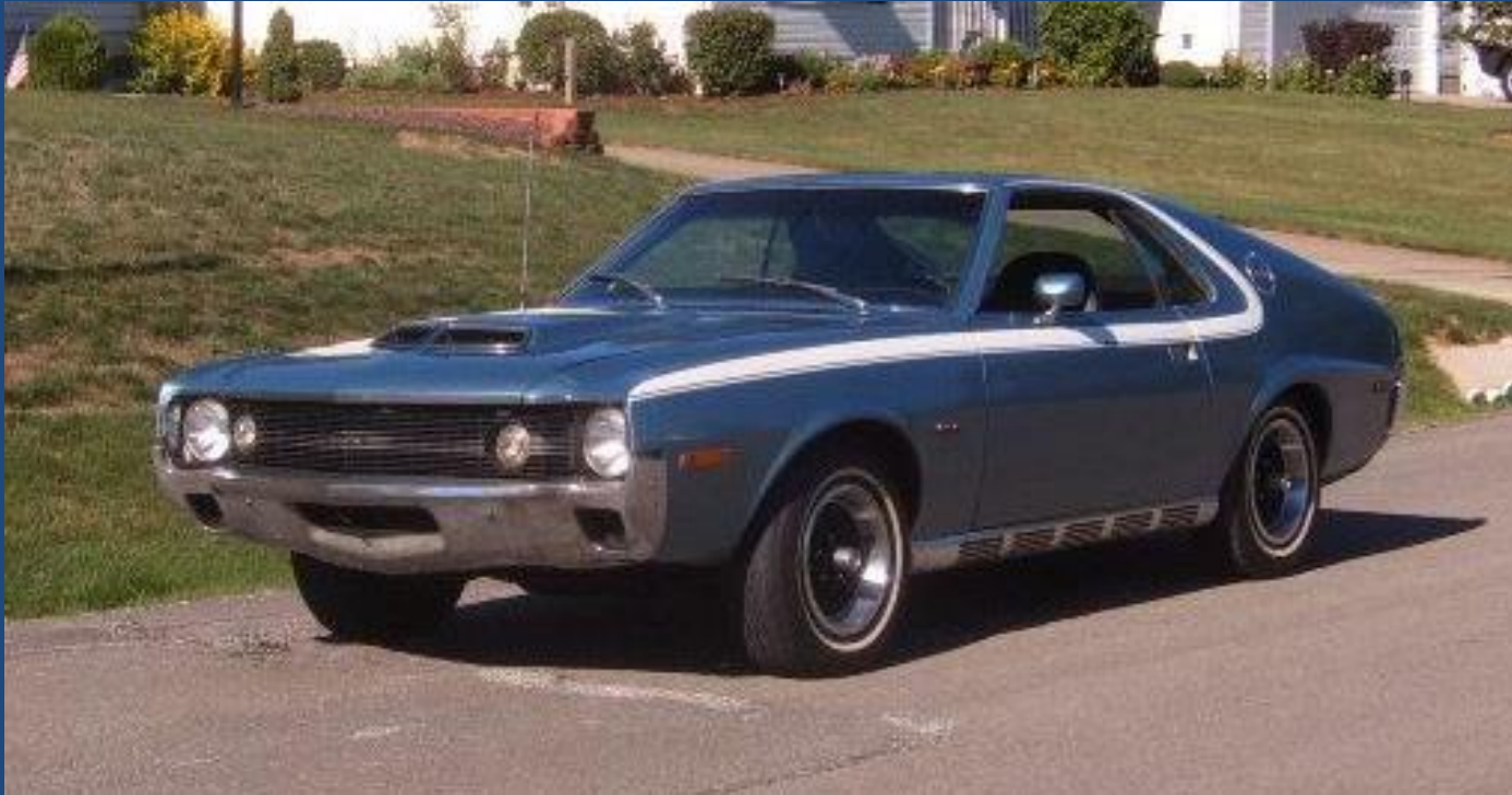
Third Car, 1970 AMX Purchased New