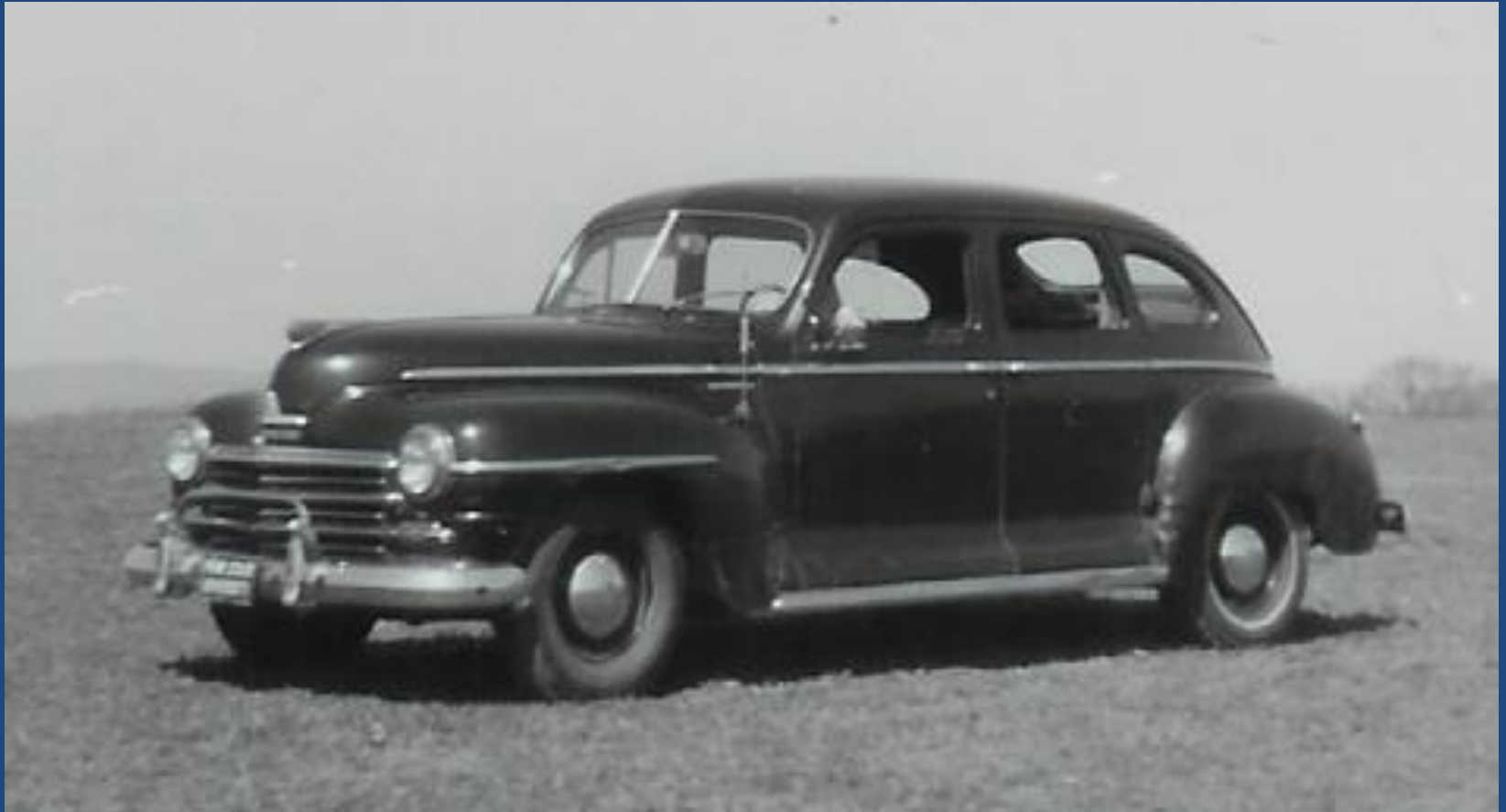
First Car, $50 1948 Plymouth